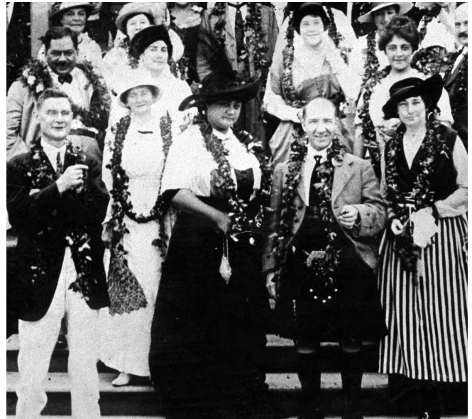
Sir Harry between the two ladies at luau in Honolulu in 1914