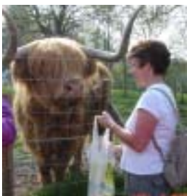
Everyone wanted to feed this big beastie, Highland Black Angus steer, Hamish

The weather was superb. From the low 30's in the early a.m. to the low 70's by afternoon for the first week; then it turned COLD. We had gloves, ski caps and lots of layers. The locals thought we were nuts!