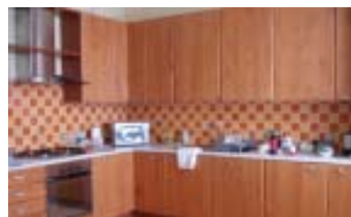
Our expansive kitchen in the Edinburgh flat