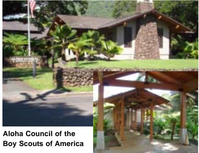
Aloha Council of the Boy Scouts of America

THE PROGRAM: We will do one of the Chieftain’s get-acquainted activities and hear some updates, especially on The Falls of Clyde situation. The program itself will begin with an Introduction to Scottish Castles, accompanied by pictures. Then we will meet some “Castle People,” members who will speak for a few minutes in the voice of someone associated with a particular castle at a particular time in history. We can expect to hear from a laird, a maid, a hostess, a lady’s companion and tapestry