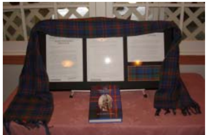
Display at the Annual General Meeting of the State Legislature's approval of the resolution designating April 6 every year as Tartan Day and acknowledging the Hawaii Tartan.