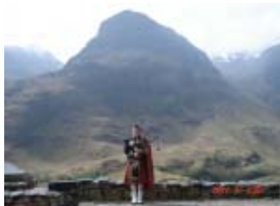
Piper gave a special poignancy to Glen Coe visit

The flights were perfect and we even escaped a near disaster when Bill tumbled down at set of stairs on our first night and landed on his new bionic knee. Bloodied but not broken. It was a trip to remember and we're happy to report we have a new Siberian Husky, aptly named Pepper, so no more big trips in our future!