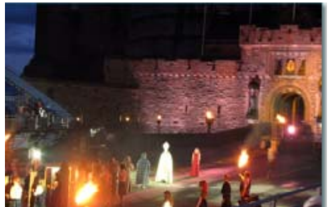
'Aisling's Children: Tales of the Homecoming' Edinburgh Castle Esplanade