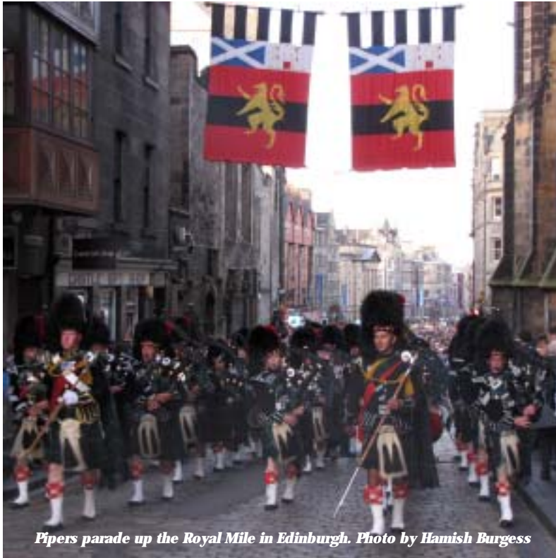
Pipers parade up the Royal Mile in Edinburgh.