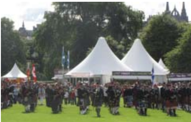
Sat-Sun July 25-26th - 'The Gathering' took place at Holyrood Park in Edinburgh

Truly a 'once in a lifetime' Scottish experience, the full tartan-clad story with pictures is available at www.mauiceltic.com . Pics here from that site.