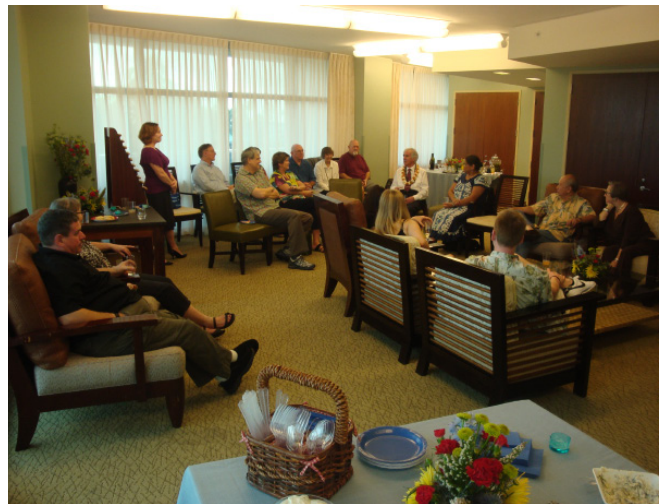
A relaxed group got to know John Cairney at a gathering in his honor on Sunday, Jan. 31.

You can see more from Burns Night and Cairney reception