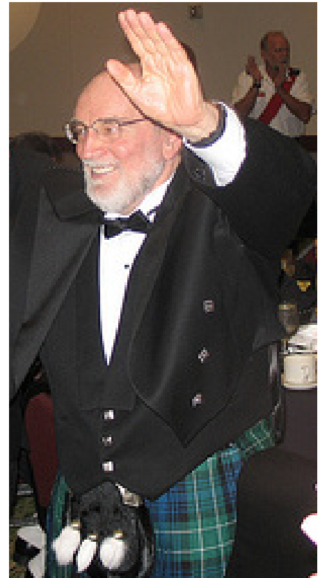
Gov. Neil Abercromie acknowledges the cheer from the crowd as he is introduced. With a lot on his plate he still managed to don his kilt and join the group.