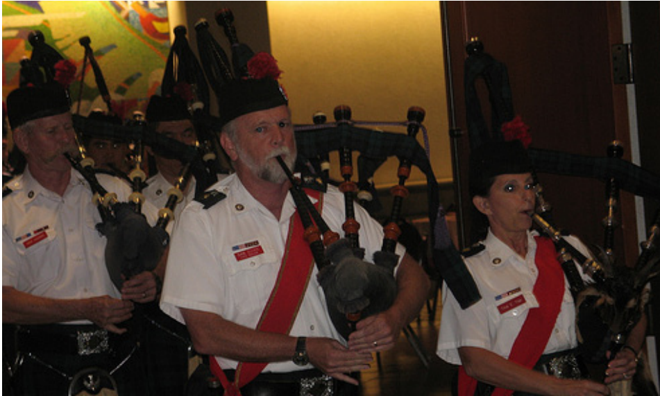
The Celtic Pipes & Drums march in to kick off the evening.