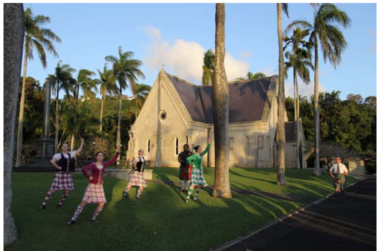
Highland dance in the shadows of Mauna Ala

The assembled group of 25 or so people then walked down the stairs into the crypt to place several lei in front of the plaque commemorating Princess Ka'iulani. It was a moving celebration for the "daughter of a double race."