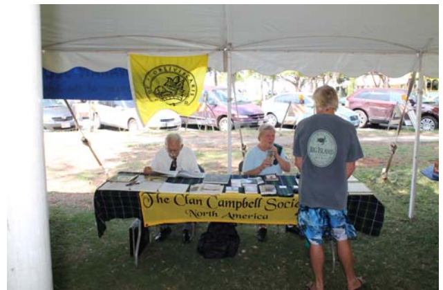
Clan Campbell welcomes visitors