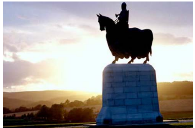
Left to Right: Stirling Castle, Statue of Robert the Bruce at Bannockburn