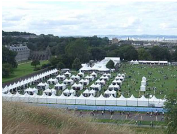
Center: Clan Village, Edinburgh 2009