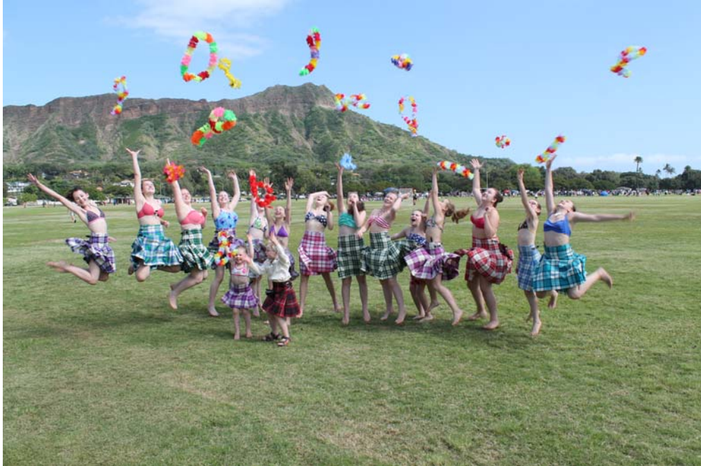
Highland dancers celebrate Hawaii