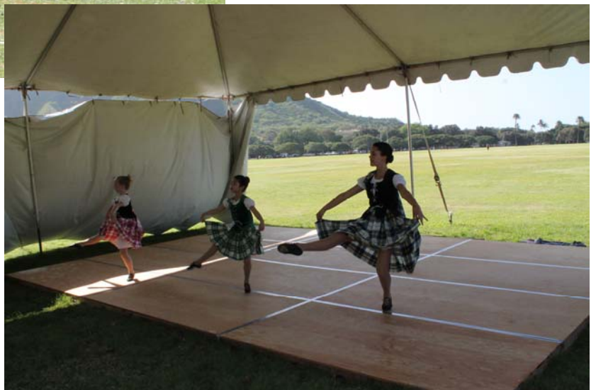
Highland dance competition