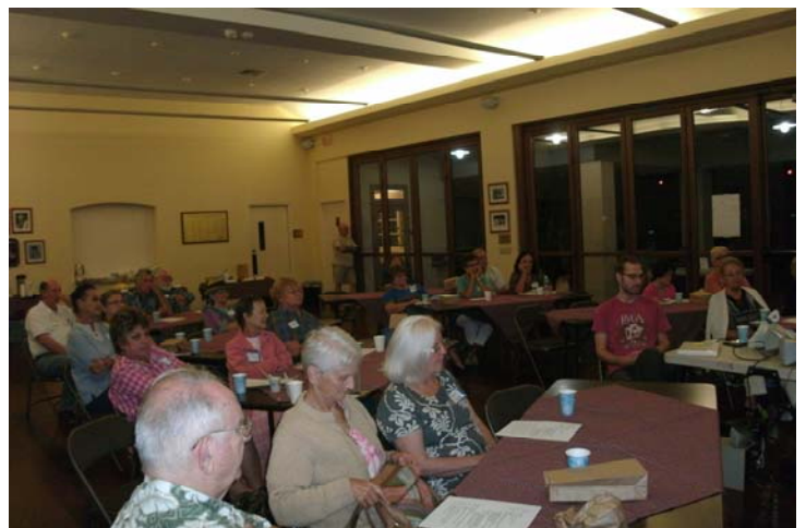
Mar 3. Princess Ka'iulani movie