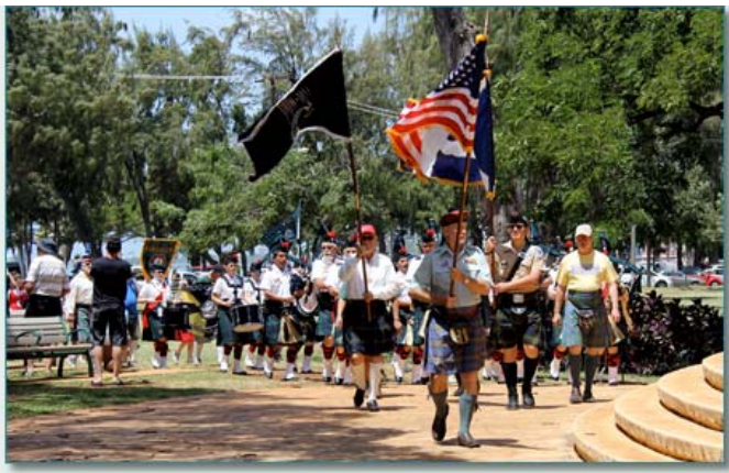
Celtic Pipes & Drums lead the opening parade