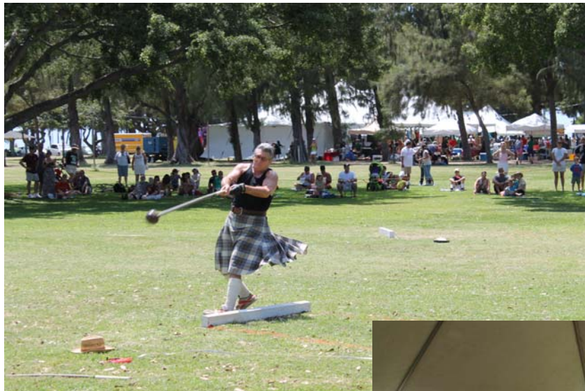
Competitor throws the mighty hammer