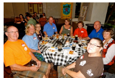
Dinnertime at Ferguson's Pub