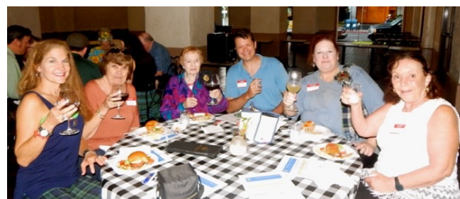
A Toast to the Clans