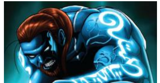
Saltire #1 Invasion www.comicbookkid.co.uk