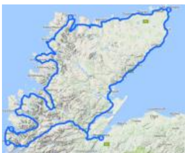
North Coast 500 Inverness at circle in lower right

The picturesque route begins at Inverness Castle before heading north on the A862 through Dingwall and on to the Black Isle. From there it skirts the coastlines of Sutherland and Caithness before coming down into Wester Ross and the Applecross Peninsula, then turns inland back towards Inverness. A variety of memorable scenery—from tranquil to eye-popping—are hallmarks of the route. Along the gentle coastline in the east, the sparse landscape is dotted with purple heather and yellow gorse and the road is sometimes shared with gentle Highland cattle.