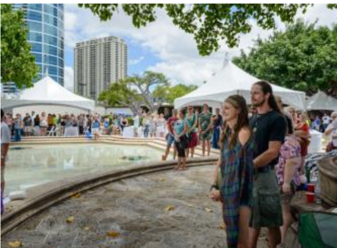
The crowd watching the band and parade at McCoy Pavilion