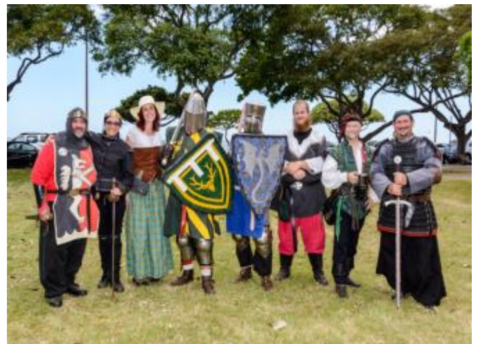
Society for Creative Anachronism