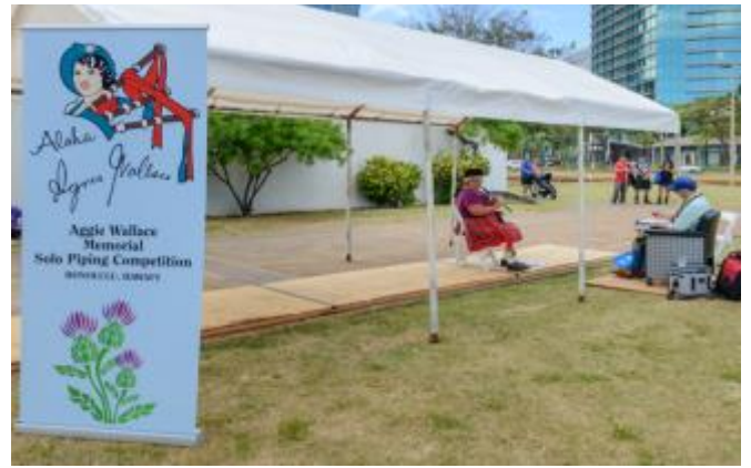
A first this year—Aggie Wallace Memorial Solo Piping Competition