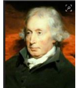
Adam Ferguson 1723-1816

In the 18 th and early 19 th Centuries, sometimes known as the European Age of Reason, Scotland produced an outpouring of intellectual and scientific accomplishments that is still known today as The Scottish Enlightenment. Robert Burns, born in 1759, was very much a man of his time and well aware of new ideas and social changes in Scotland and in the world around him. We will explore how some Burns poems illustrate ideas also advanced by other thinkers of the era, whom we will hear from as well. (See page 3 for interesting quotes on The Scottish Enlightenment)