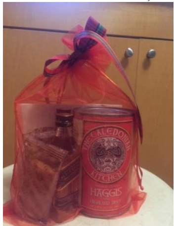
The Haggis Tasting Bag