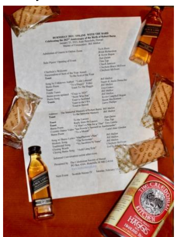
Program & contents of Haggis Tasting Bag