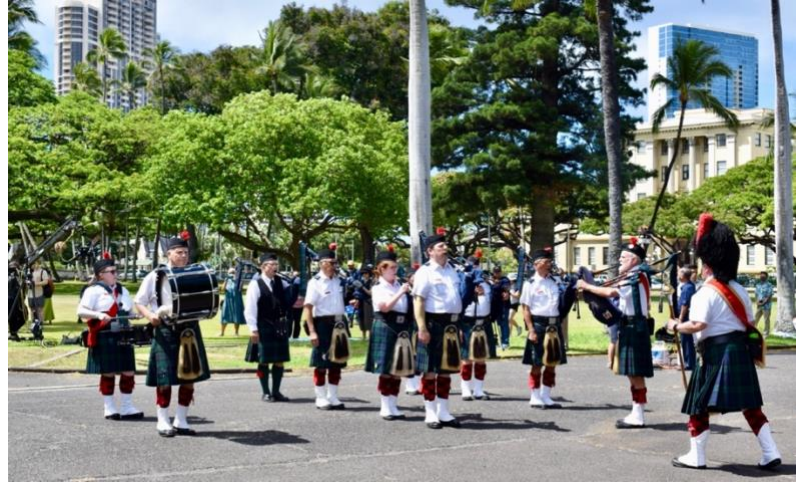
Celtic Pipes & Drums of Hawaii