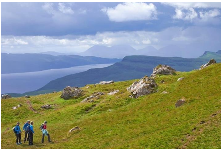
Walking through Scotland; www.backroads.com/Scotland