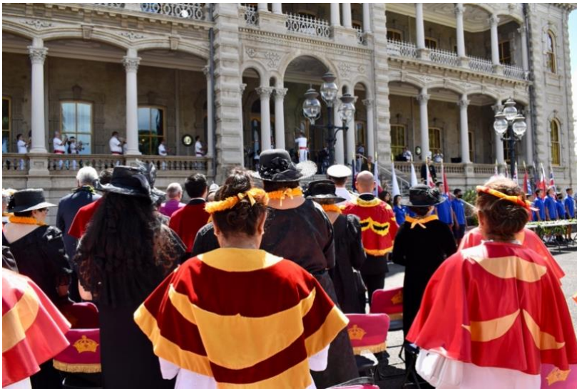
Royal groups listening to the Royal Hawaiian Band