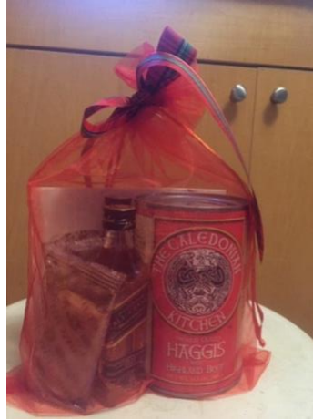
The Haggis Tasting Bag