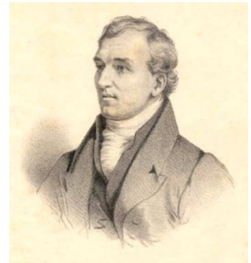
David Douglas 1799-1834