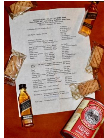
Program & contents of Haggis Tasting Bag