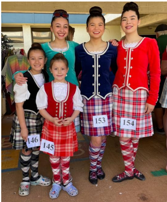
Highland dancers from Scotland