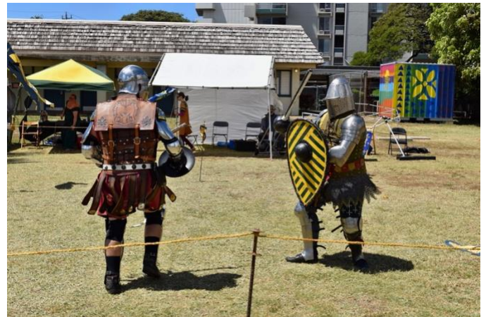
Exhibition Society for Creative Anachronism